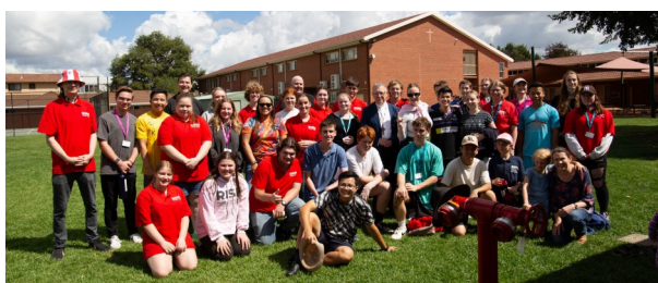
Catholic Parishes of Mudgee, Gulgong and Kandos